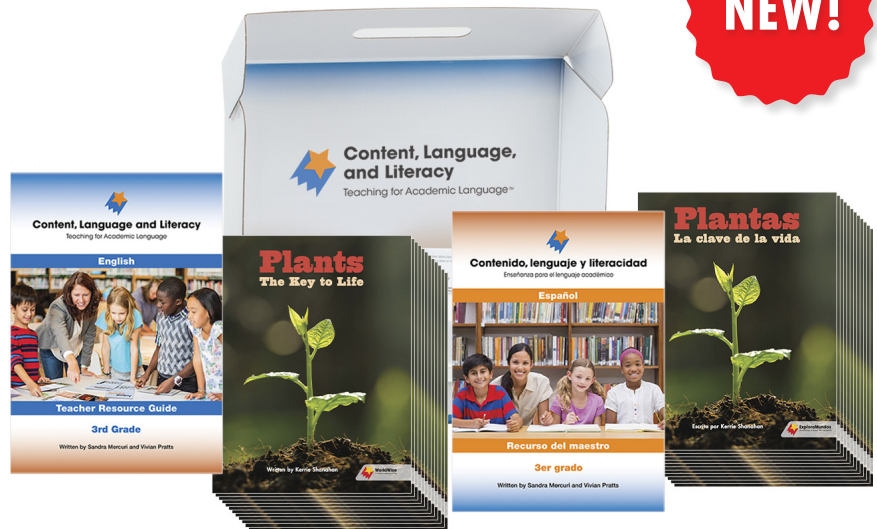
Shown: Grab-and-Go Kit for Unit 5

Content, Language and Literacy™ (CLL) is a bilingual academic language and literacy program that integrates explicit language instruction with grade-level science content . Designed for multilingual learners and emergent bilinguals, CLL helps students access complex texts and use academic language purposefully to make meaning.